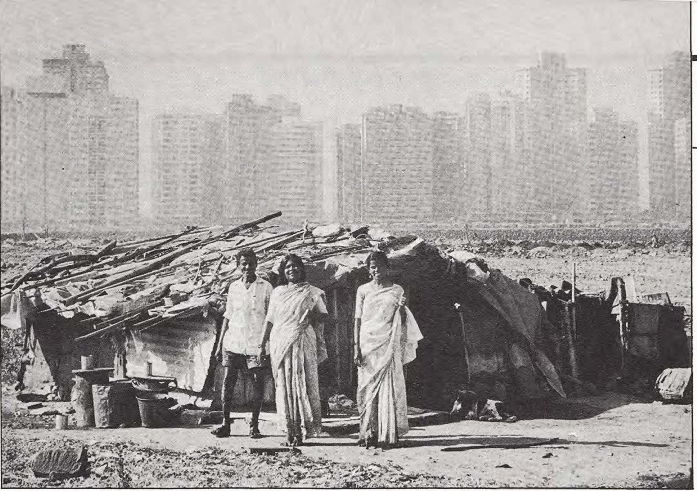
Wealth gap: Construction workers on a housing and office-building site, in Bombay, India

exports and limit imports, and government spending cuts at a time of grievous human suffering. In effect, the masses of the Third World, and of Latin America especially, had to pay with their living standards for debts which had often been undertaken by anti-democratic regimes and had, in any case, been artificially and unfairly increased by the anti-inflation policies of western conservatives.