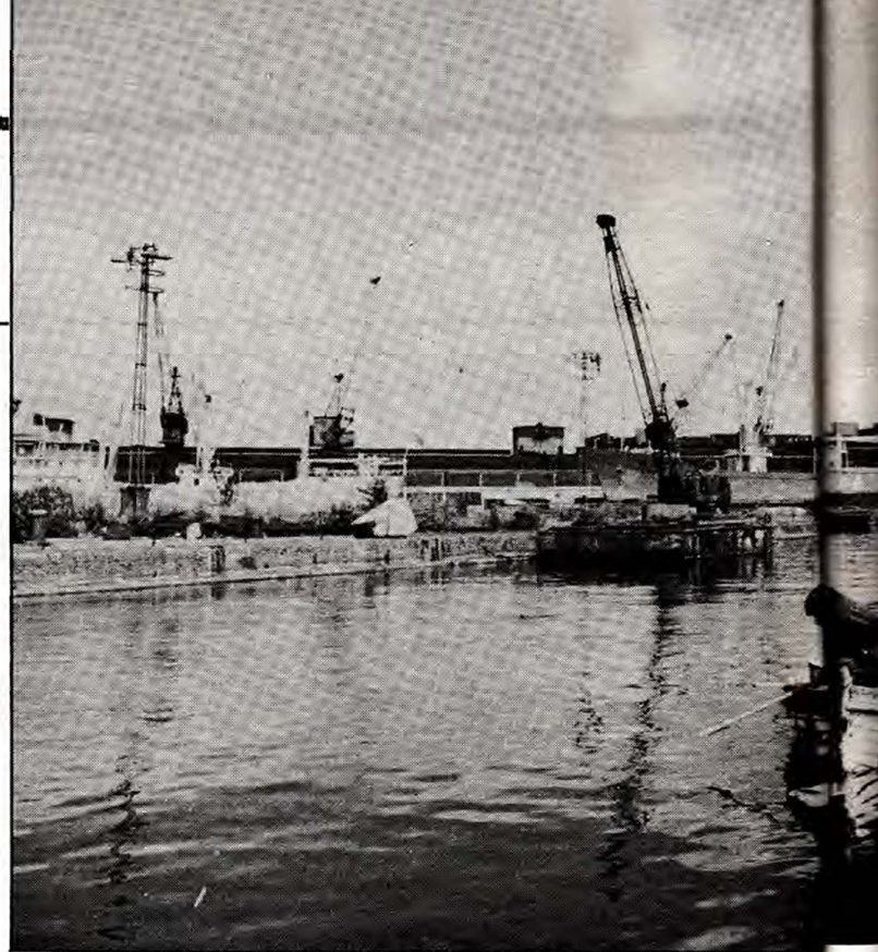
Industry adrift: Unemployed fishing for eels in London docklands

T he fate of our globe may well depend on whether a new mode of coexistence can be achieved between the two nuclear superpowers, something of which recently one could