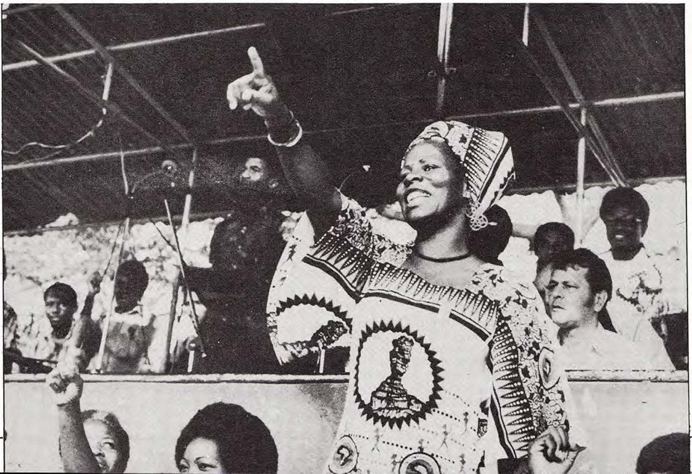
Making a point for freedom: SWAPO activist addressing a rally in Angola

(80) On the occasion of the tenth anniversary of the Soweto uprising in 1976 the South African regime stepped up repression and violence by declaring a state of emergency. Each day non-white children are being killed by state terrorism. South Africa continues to destabilise and attack neighbouring states. The world at large has a responsibility to stop this outrageous system. (81) International sanctions might be the last chance for peaceful change. The opposition in South Africa supports them. Therefore, the SI calls for: - halting investments in South Africa and ending government