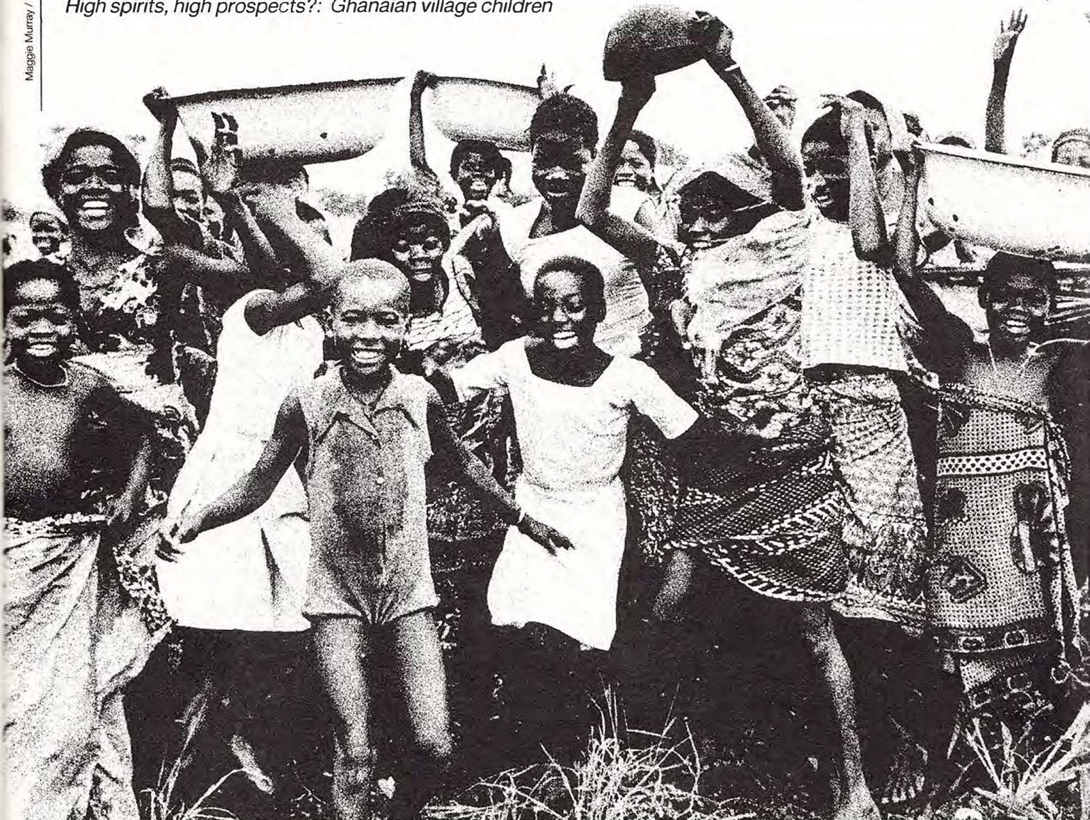
High spirits, high prospects?: Ghanaian village children

- Ninthly, it reminds us that this additional spending of $100