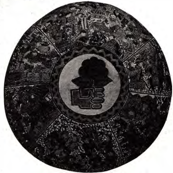
The bowl pictured above, part of the image used on the official poster of the Lima Congress, was made by Peruvian craftspeople.

And in facing up to the new challenges, many at the Lima Congress evoked the memory of Olof Palme, the late leader of the Swedish Social Democrats. Anita Gradin, head of the Swedish delegation, spoke for many when she said that 'Olof Palme was a man who had the courage to be in the forefront of many international battles; his work for peace and security, for freedom and justice, inspired many of us.'